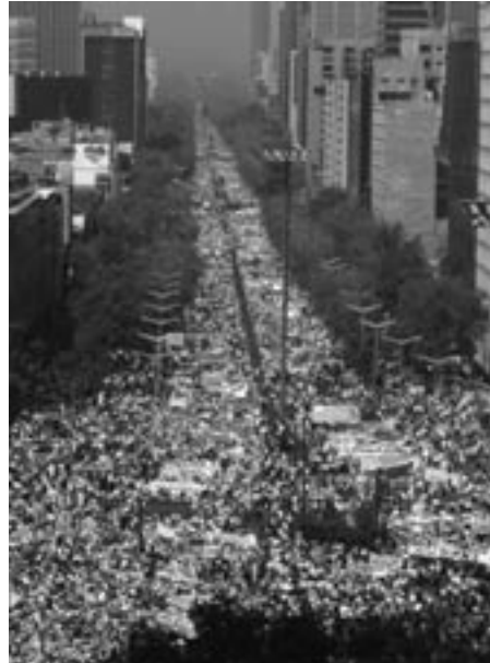
Illegal immigrants rally May 1