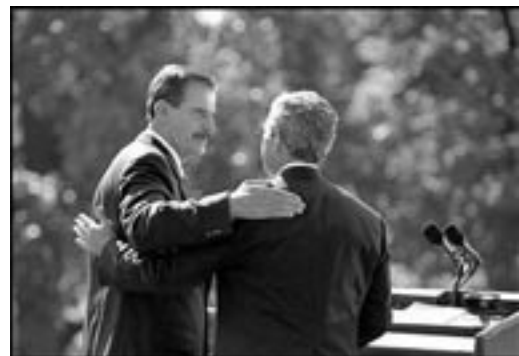
PRESIDENTS Fox and Bush have been amigos since Bush was Governor of Texas.

Providing services to illegal immigrants who become permanent legal residents would cost $10 billion more.